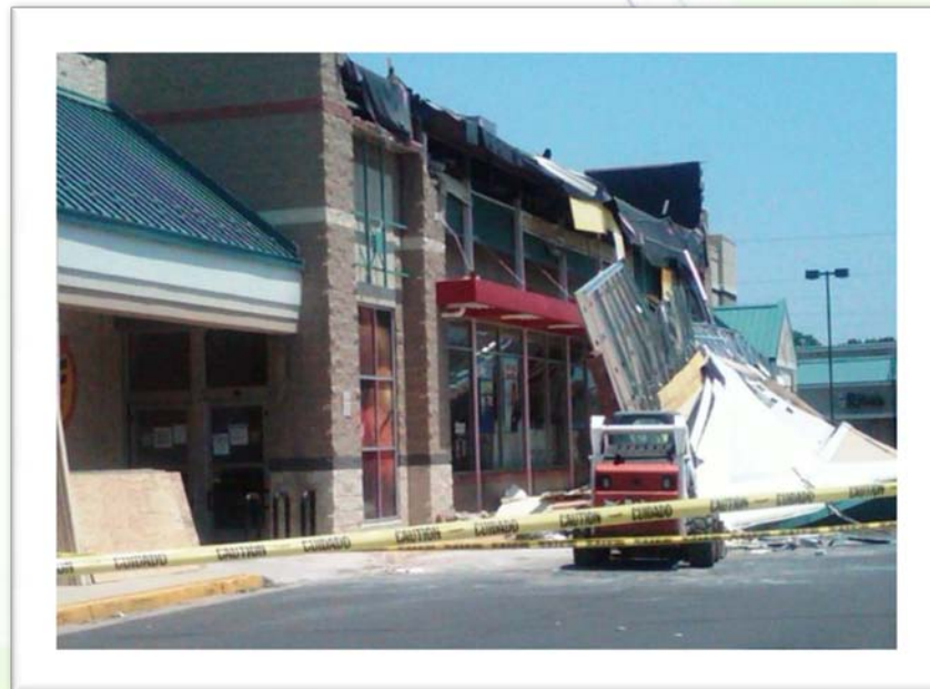
Roof Collapse, Shoppers Food Warehouse, Oxon Hill, MD